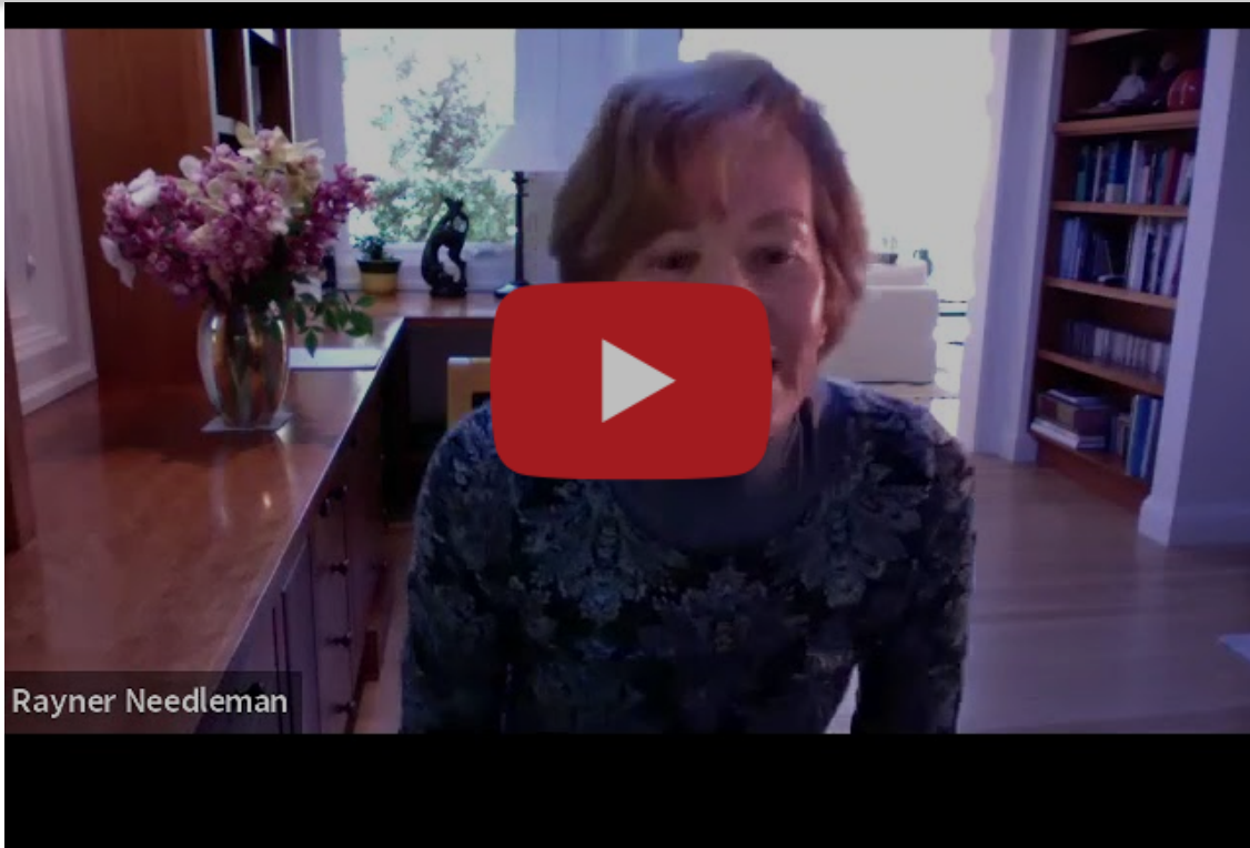
Online Chair Yoga