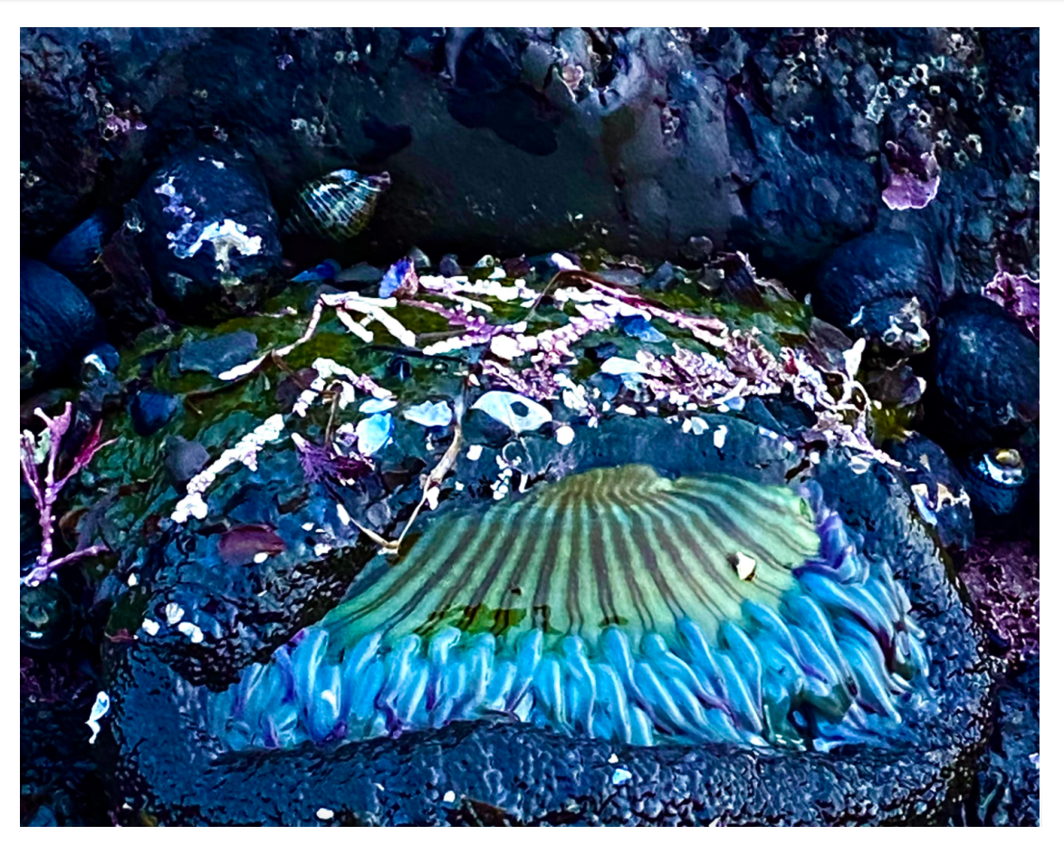
Happy Sunday, Villagers

Please <u>send along</u> your suggestions for materials to add to the daily tips. We're always looking for good content. And visit our <u>website</u> for more information about our organization and programs.