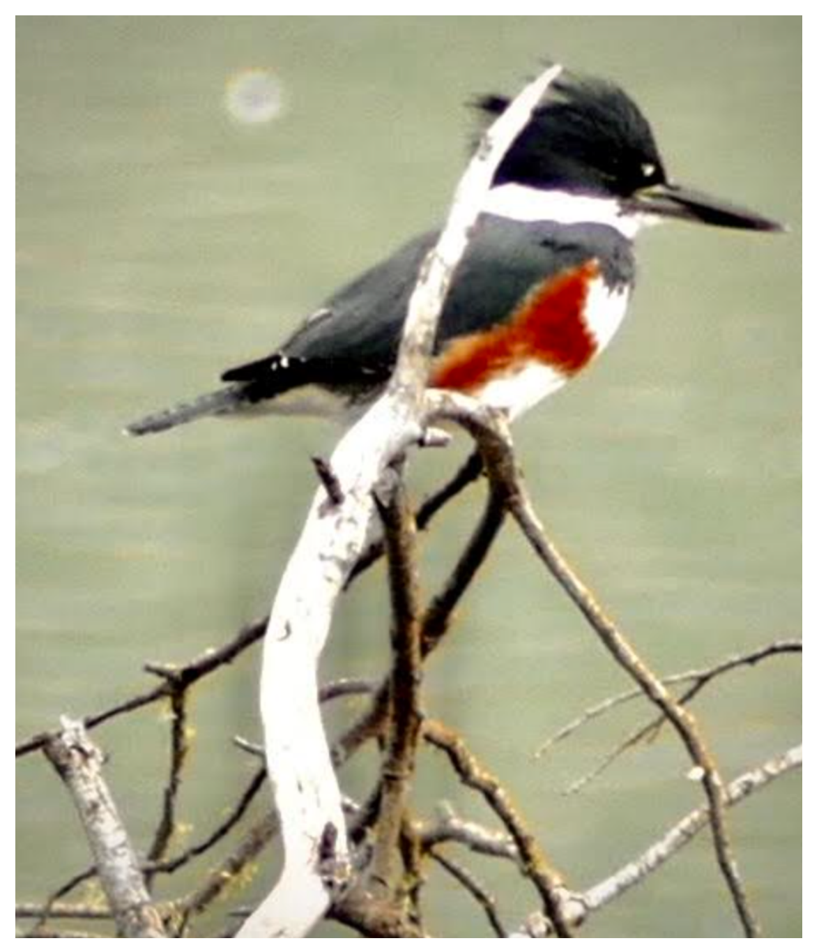
Happy Monday, Villagers

Please <u>send along</u> your suggestions for materials to add to the daily tips. We're always looking for good content. And visit our <u>website</u> for more information about our organization and programs.