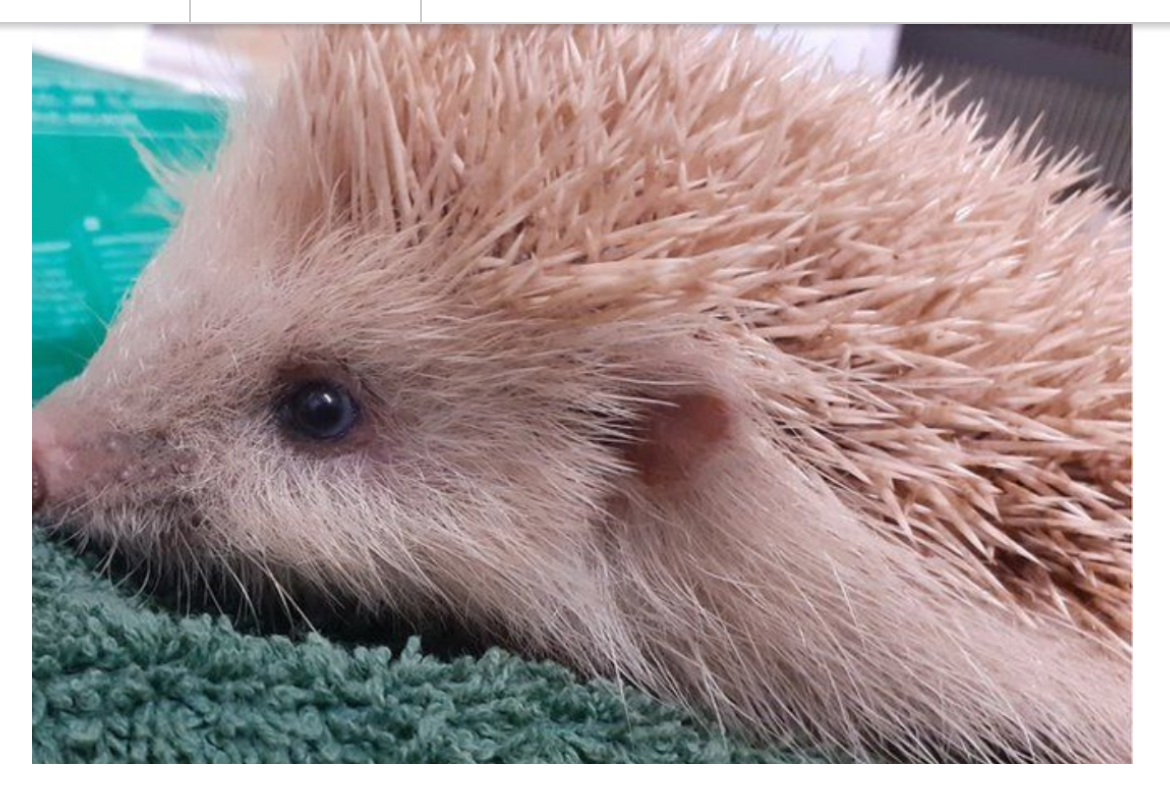
Rare blonde hedgehog rescued and nursed back to health

A rare blond hedgehog has been rescued after being found wandering around a village.