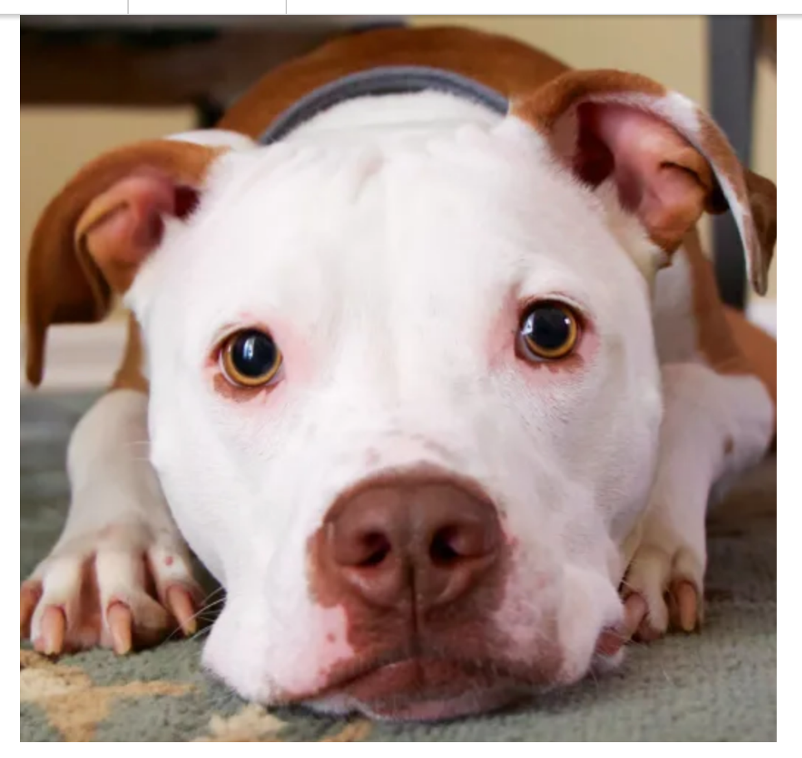
Why Are Dogs So Afraid of Vacuums?

If you routinely procrastinate vacuuming for the sake of your <u>dog</u>, you're probably not alone—the machines are notorious for sending our pets into a tailspin.