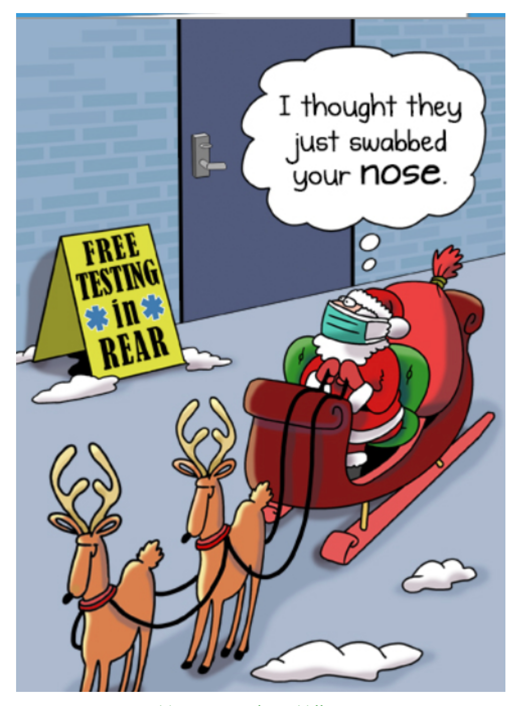
Happy Sunday, Villagers

Please send along your suggestions for materials to add to the daily tips. We're always looking for good content. And visit our website for more information about our organization and programs.