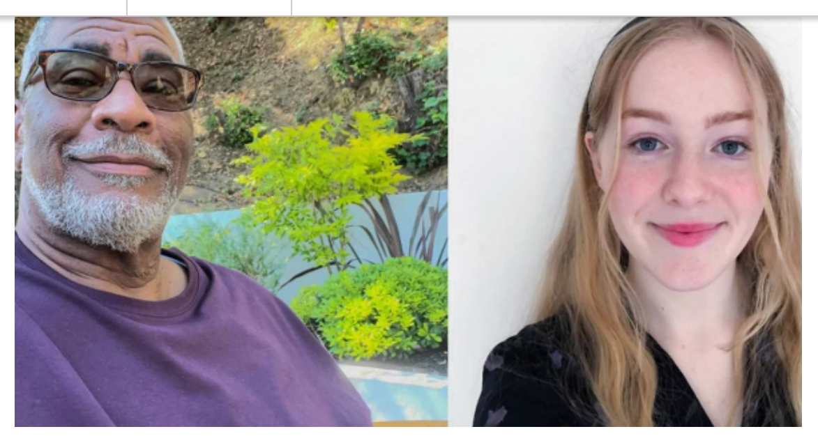
<u>An Intergenerational, Multiracial, Virtual Friendship Formed in COVID-</u> 19

The story of one 65-year-old and his new Gen Z friend