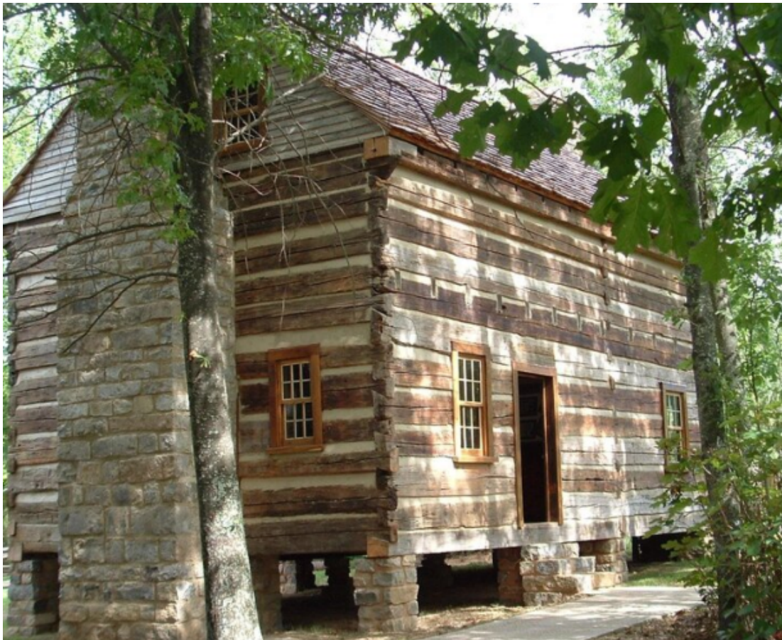
The Oldest Building In All 50 States