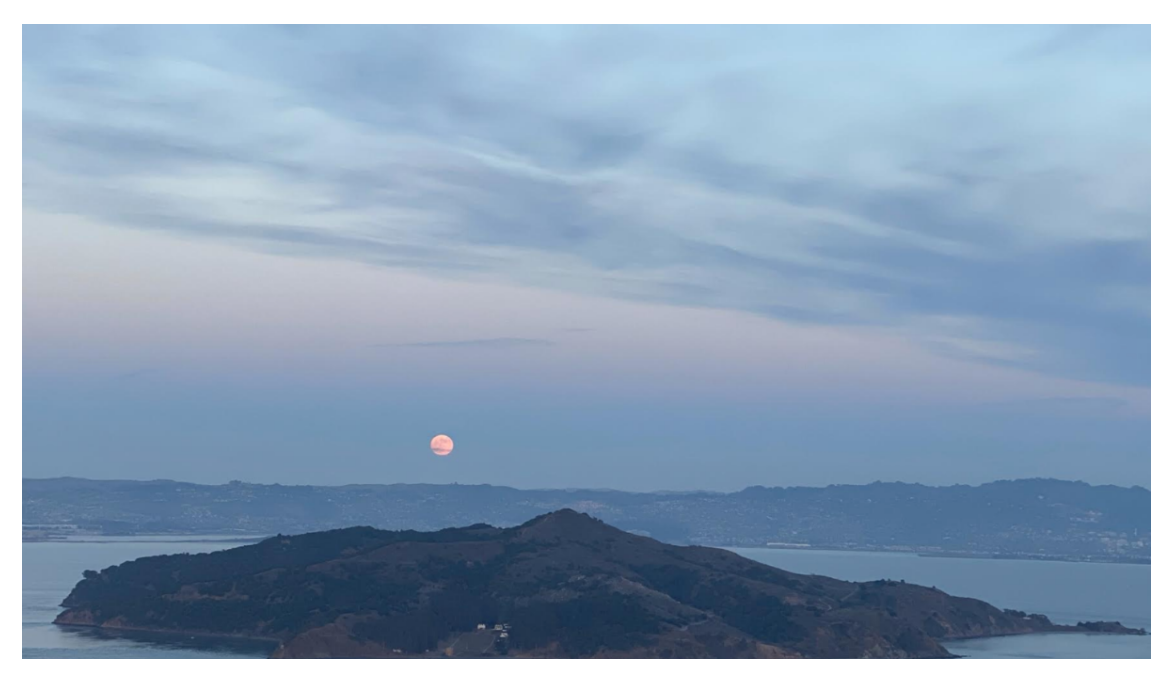
Happy Sunday, Villagers

Please <u>send along</u> your suggestions for materials to add to the daily tips. We're always looking for good content. And visit our <u>website</u> for more information about our organization and programs.