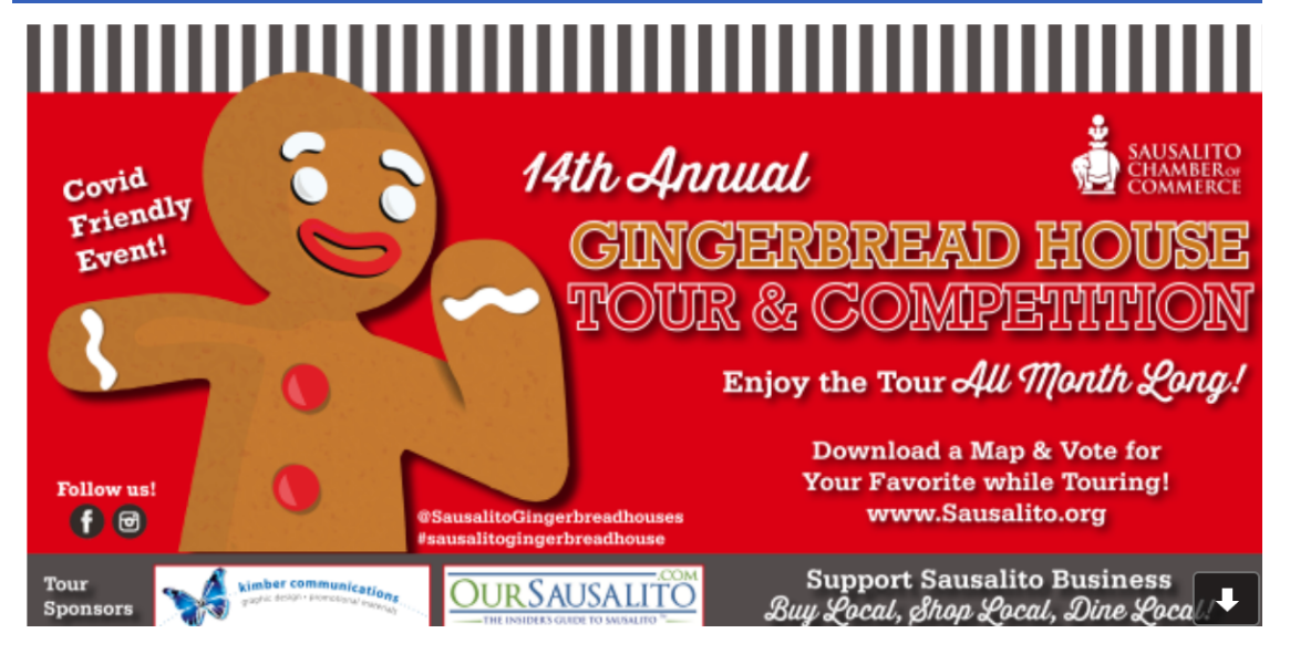
Gingerbread House Map