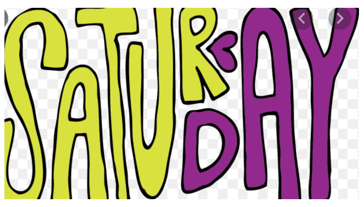
Happy Saturday, Villagers

Please <u>send along your suggestions</u> for materials to add to the daily tips. We're always looking for good content. And visit our <u>website</u> for more information about our organization and programs.