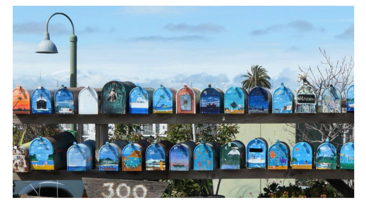
Happy Thanksgiving, Villagers

Please <u>send along your</u> suggestions for materials to add to the daily tips. We're always looking for good content. And visit our <u>website</u> for more information about our organization and programs.