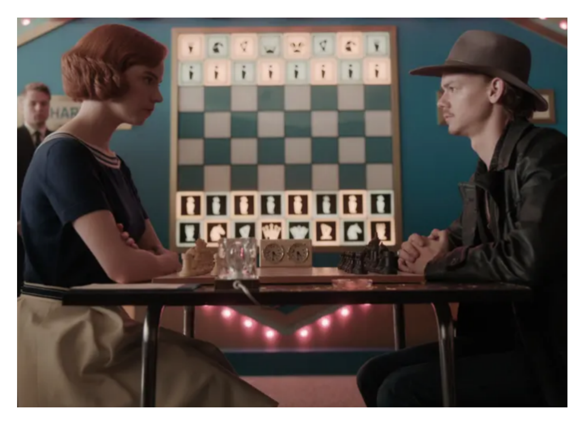
How to get good at chess