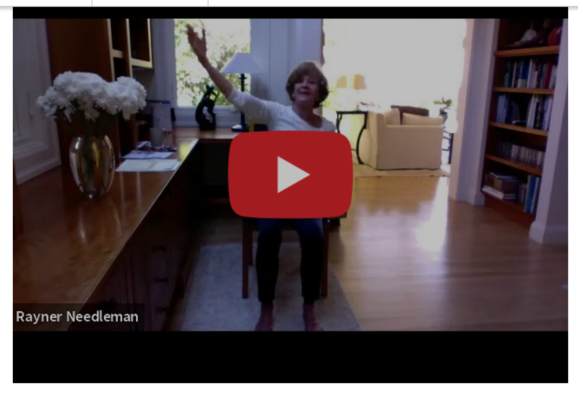
Online Chair Yoga