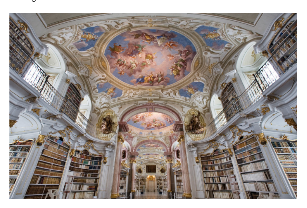
7 Spectacular Libraries You Can Explore From Your Living Room You can almost smell the old books.

grumpy but lovable janitor Mr Shaibel at the age of nine and is very soon beating him.