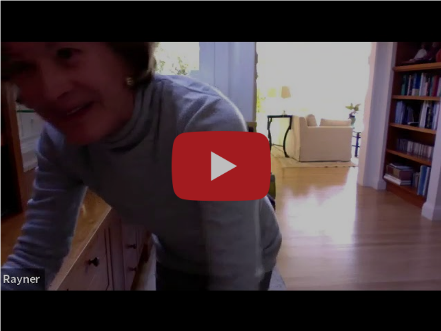
Online chair yoga.