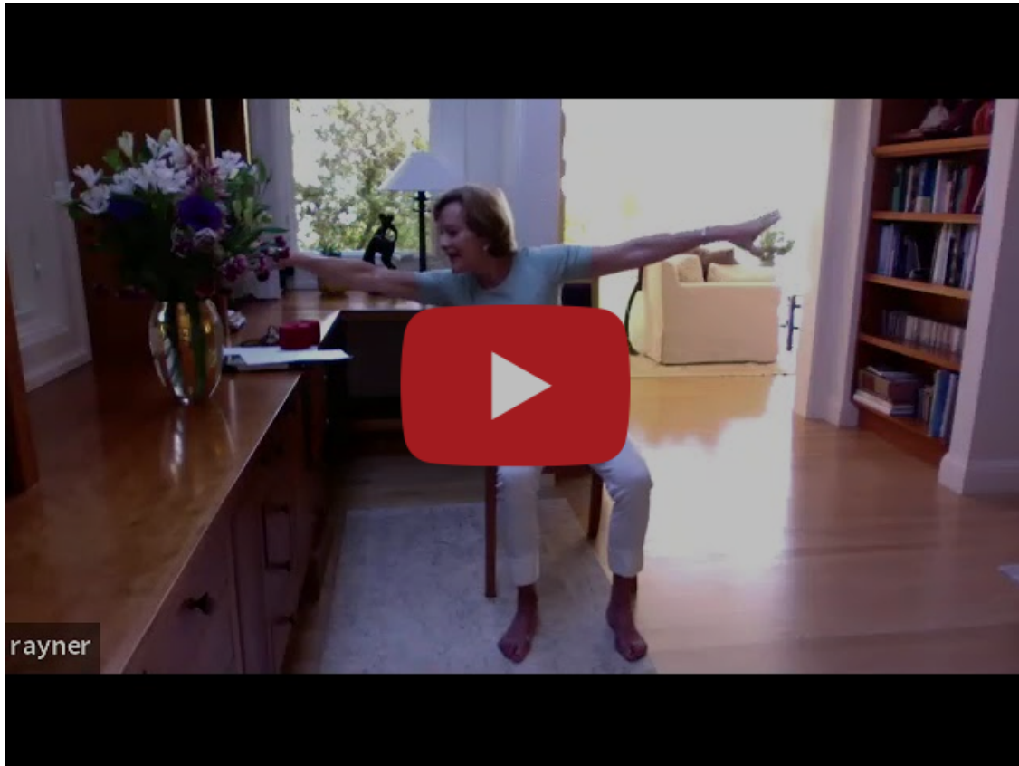
Online Chair Yoga