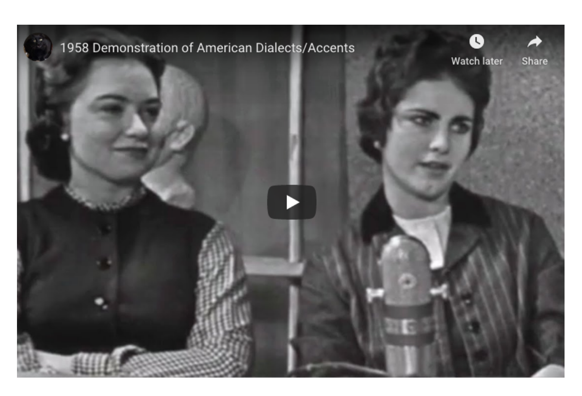
Mapping the Differences in How Americans Speak English: A