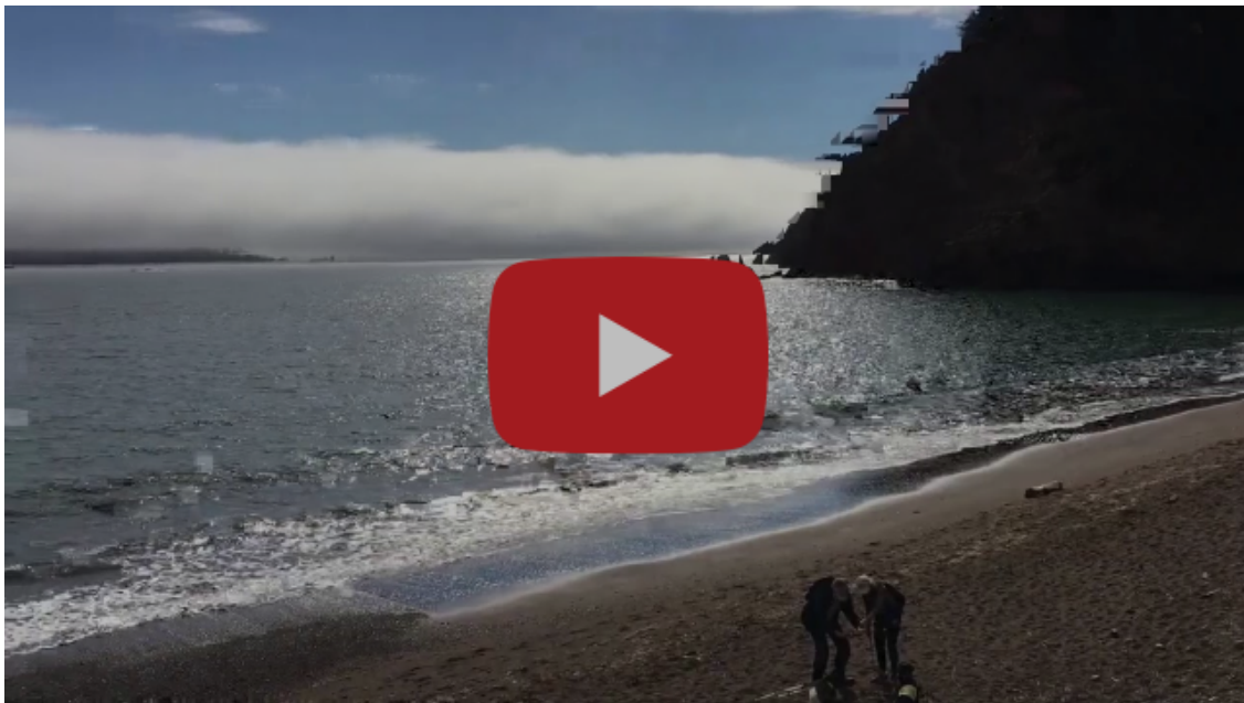
Sunlight and fog by Harrie Schwartz

For various important reasons, many students submit their work only at the very last minute of the deadline. That means mistakes are inevitable. After all, working against the clock demands sacrifices.