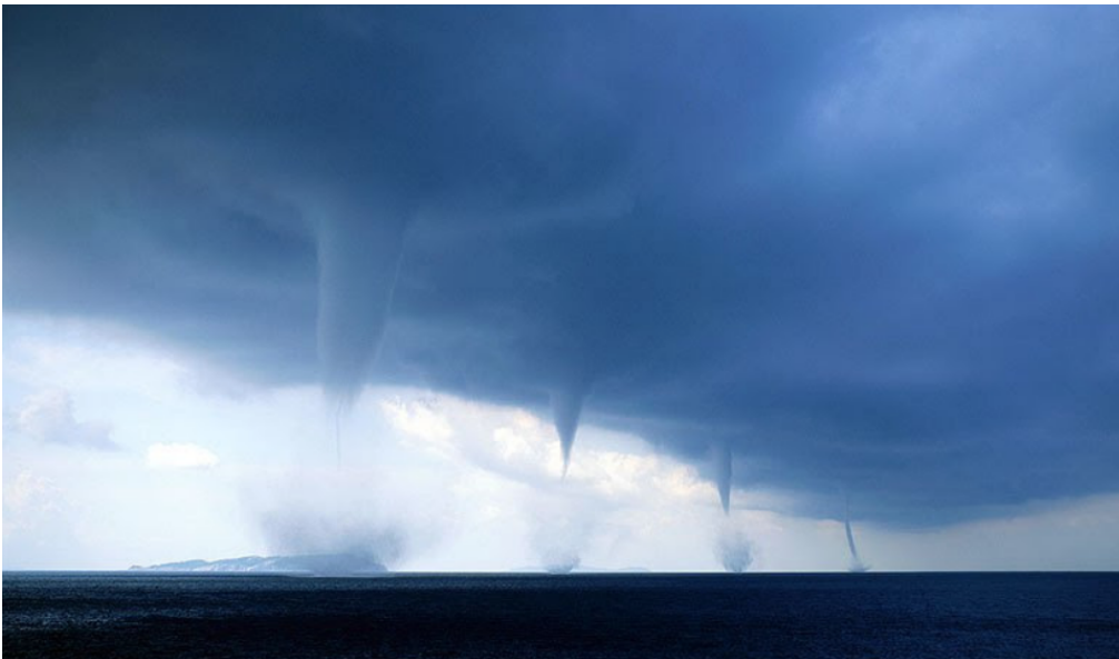
Waterspouts Over The Adriatic

Europe's long and varied coastline is dotted with settlements whose inhabitants have, for centuries, made their living from the sea. Today, many feature historic mansions, charming historic squares and quaint harbors that draw as many tourists as fishermen. Though some have grown into cities, others are constrained by the physical landscape to remain impossibly beautiful coastal towns.