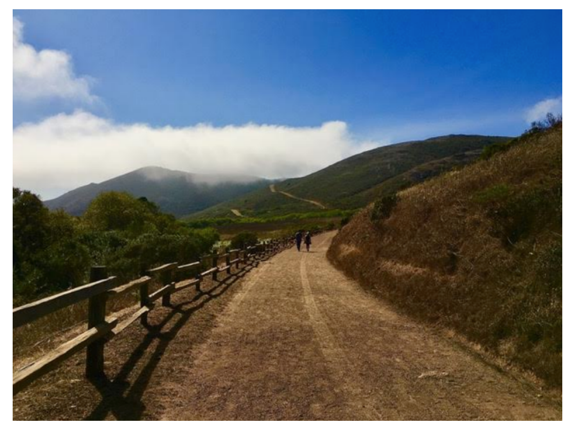
Happy Friday, Villagers

Please <u>send along</u> your suggestions for materials to add to the daily tips. We're always looking for good content. And visit our <u>website</u> for more information about our organization and programs.