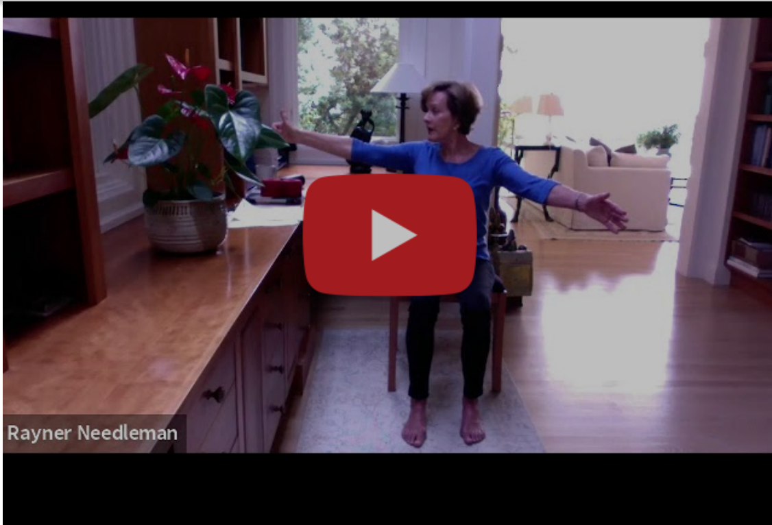
Online chair yoga