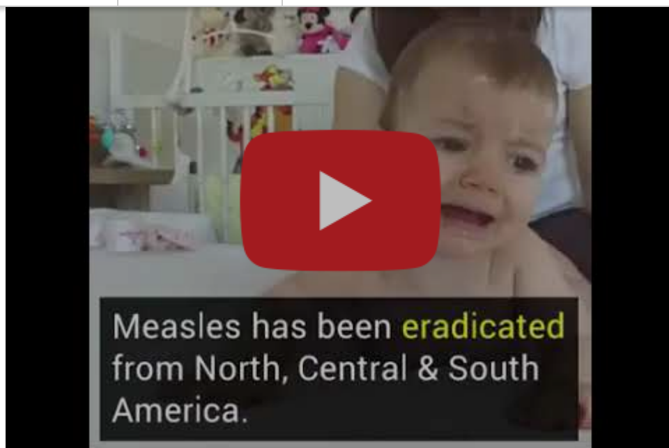
A Good News Short Video.