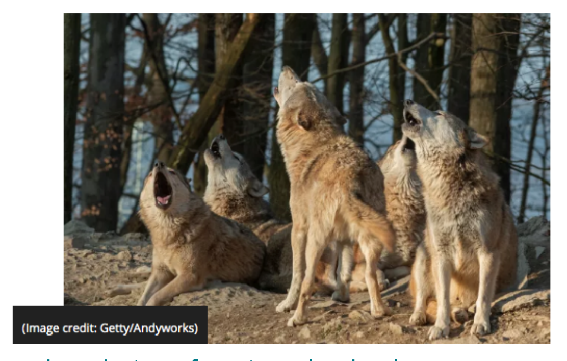
Amazing photos of nocturnal animals