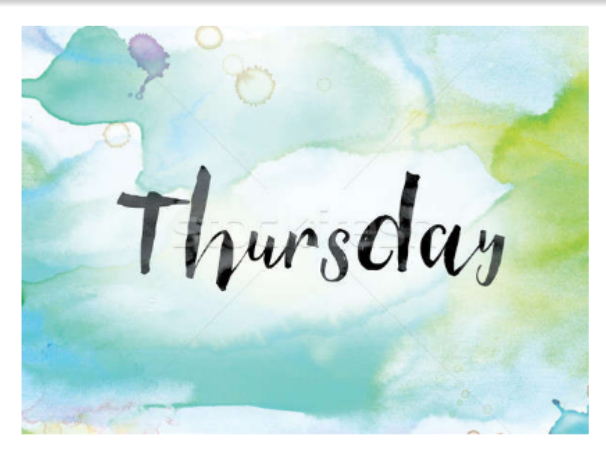
Happy Thursday, Villagers

Please <u>send along</u> your suggestions for materials to add to the daily tips. We're always looking for good content. And visit our <u>website</u> for more information about our organization and programs.