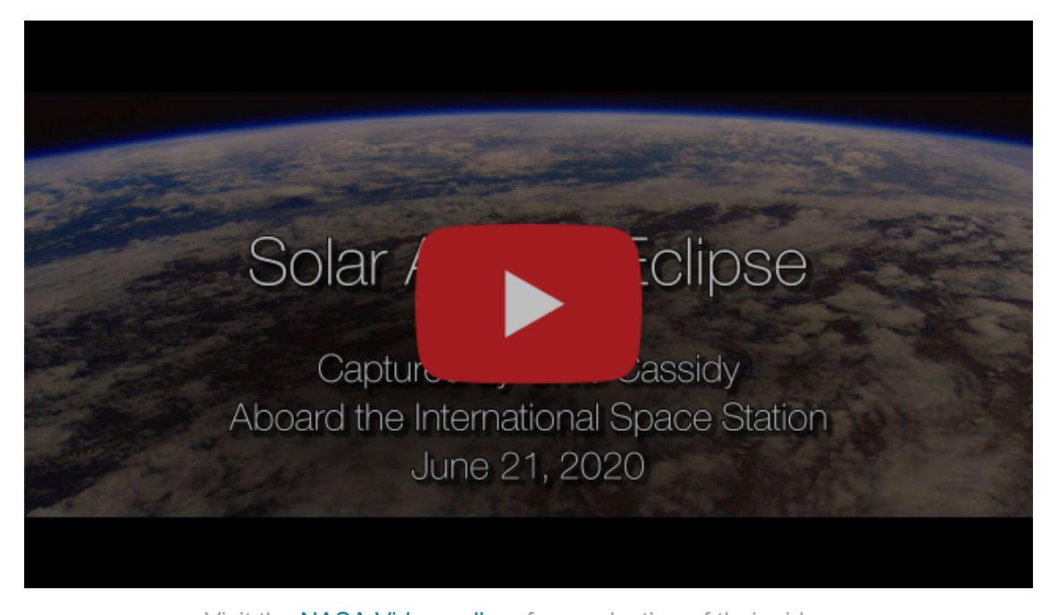
Visit the NASA Video gallery for a selection of their videos.

There comes a point in your traveling life when following the herd just won't cut it anymore. It's not that Mexico, Switzerland, or India aren't worth your time, but if you've "been there, done that" and are now looking for something a little off the beaten track, then here are our picks for the five coolest countries you haven't heard of.