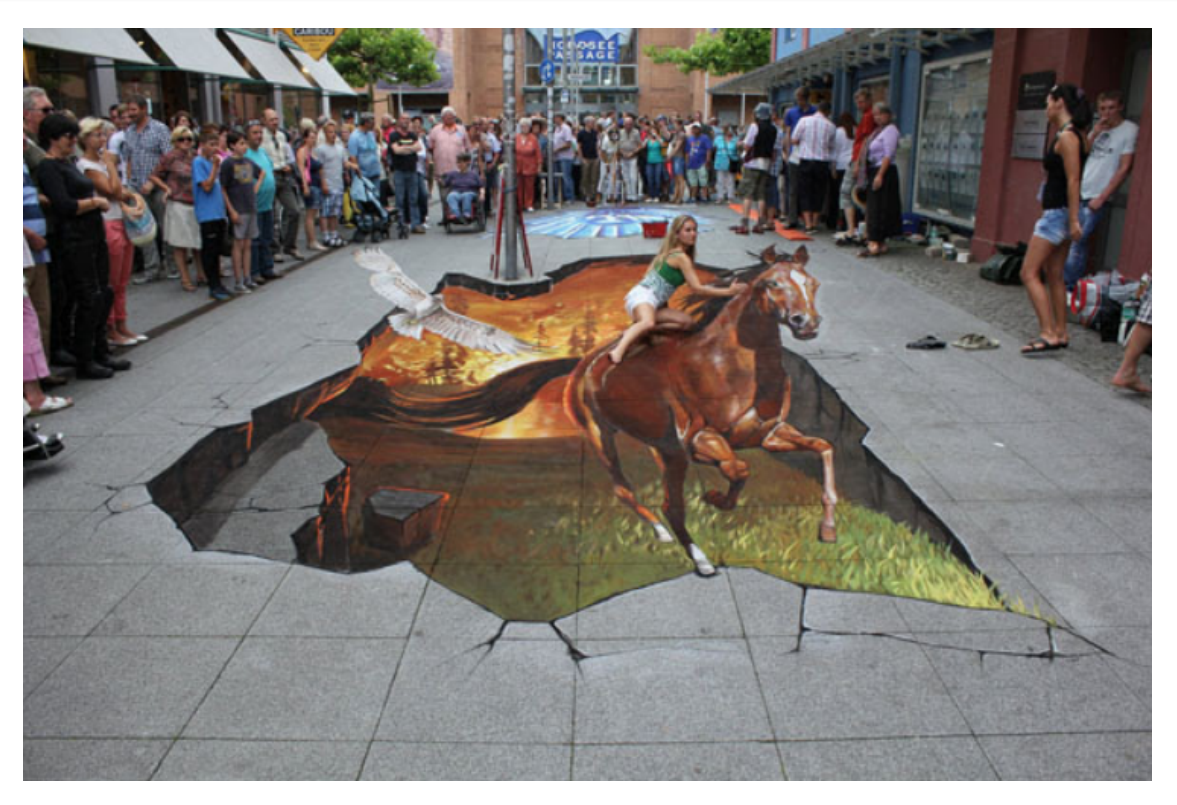
Happy Friday, Villagers

Please <u>send along</u> your suggestions for materials to add to the daily tips. We're always looking for good content. And visit our <u>website</u> for more information about our organization and programs.