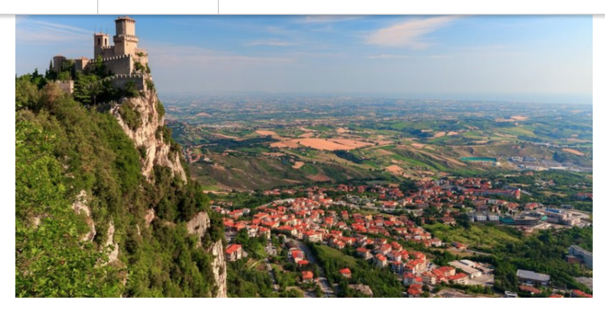
The 5 Coolest Countries You Haven't Heard Of

There comes a point in your traveling life when following the herd just won't cut it anymore. It's not that Mexico, Switzerland, or India aren't worth your time, but if you've "been there, done that" and are now looking for something a little off the beaten track, then here are our picks for the five coolest countries you haven't heard of.