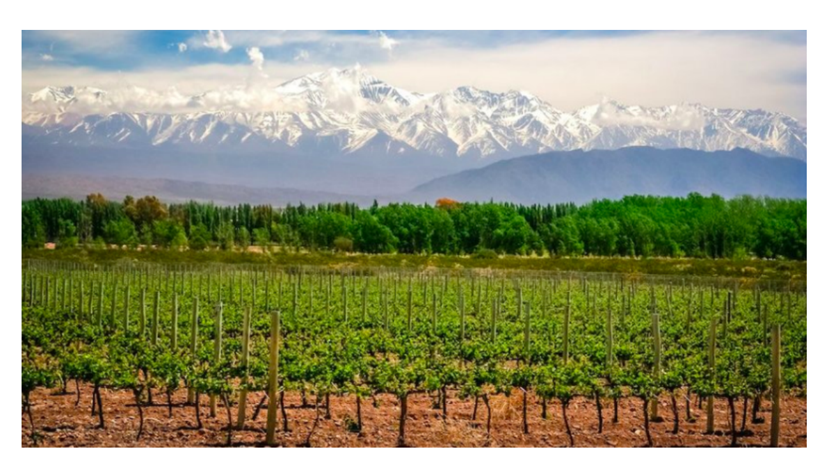
The Best Winery on Each Continent

Walking through the aisle of your local grocery store you'll find wines grown from regions around the world. But if you're ready to take the wine-tasting on the road, there are plenty of wineries to bring your passion for travel and vino together. Selecting the best wineries in the world to visit can definitely be a challenge. To get you started, we're sharing our picks for the best winery to visit on each continent.