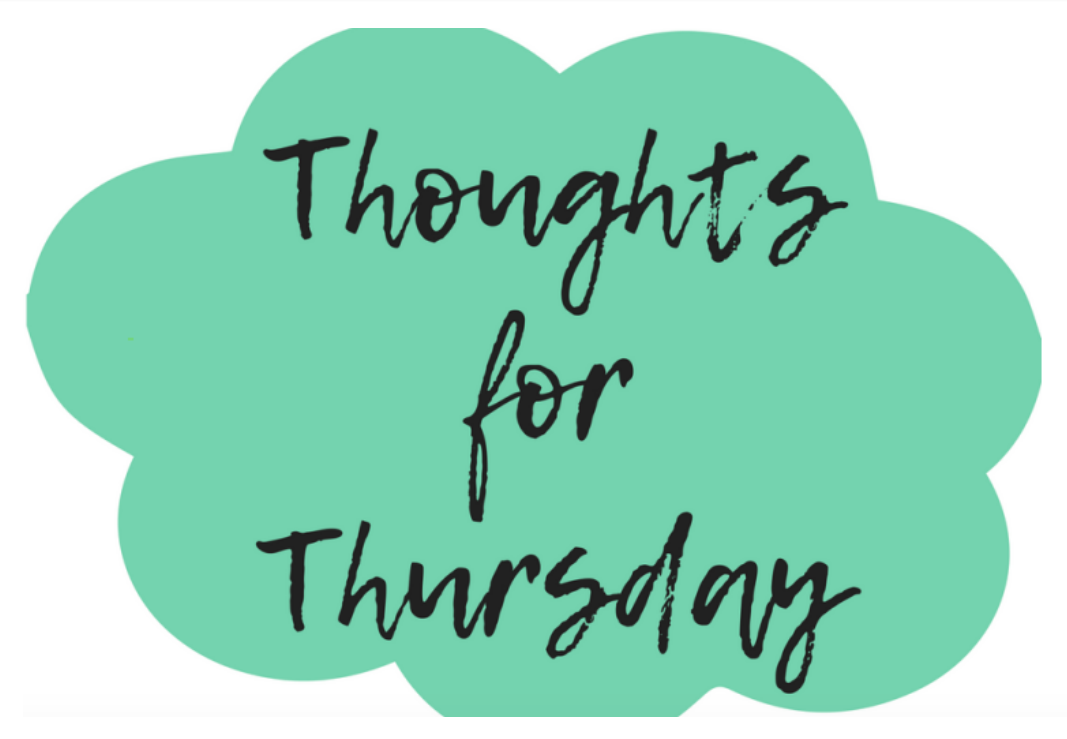
Happy Thursday, Villagers

Please <u>send along</u> your suggestions for materials to add to the daily tips. We're always looking for good content. And visit our <u>website</u> for more information about our organization and programs.