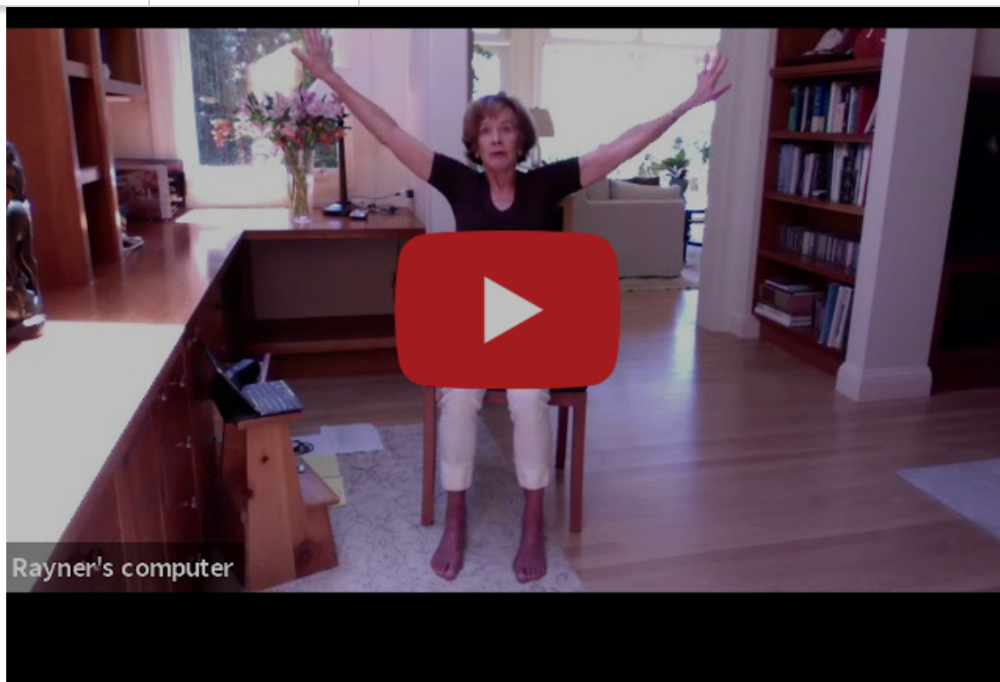
Monday's Chair Yoga