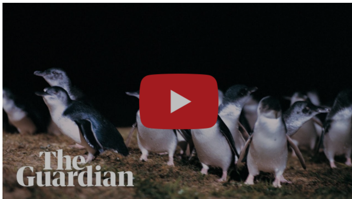
Sports Commentator of Mabel and Olive fame.