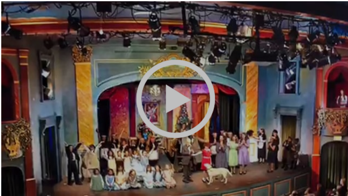
The history of Mill Valley's Throckmorton Theater.