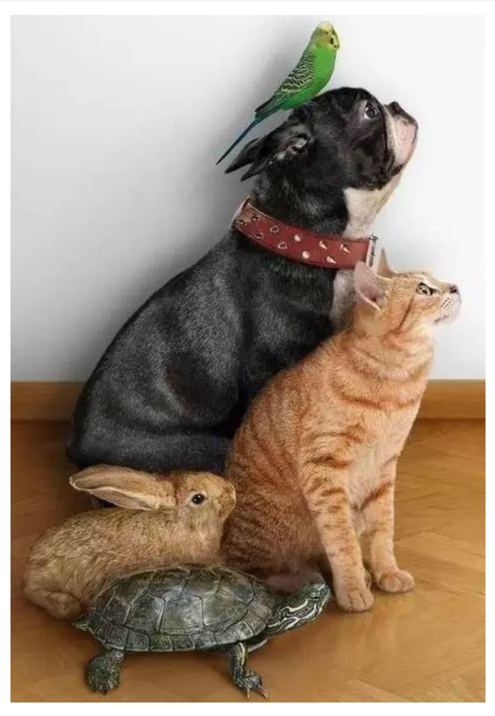
Happy Friday, Villagers

Please <u>send along your suggestions for materials to add to the</u> daily tips. We're always looking for good content.