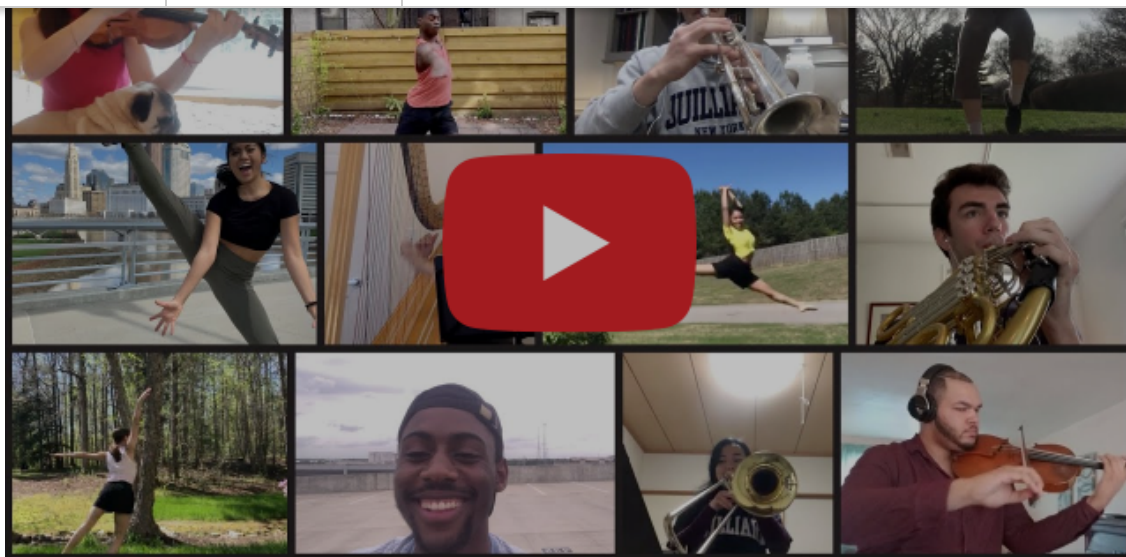
Julliard students perform Bolero.