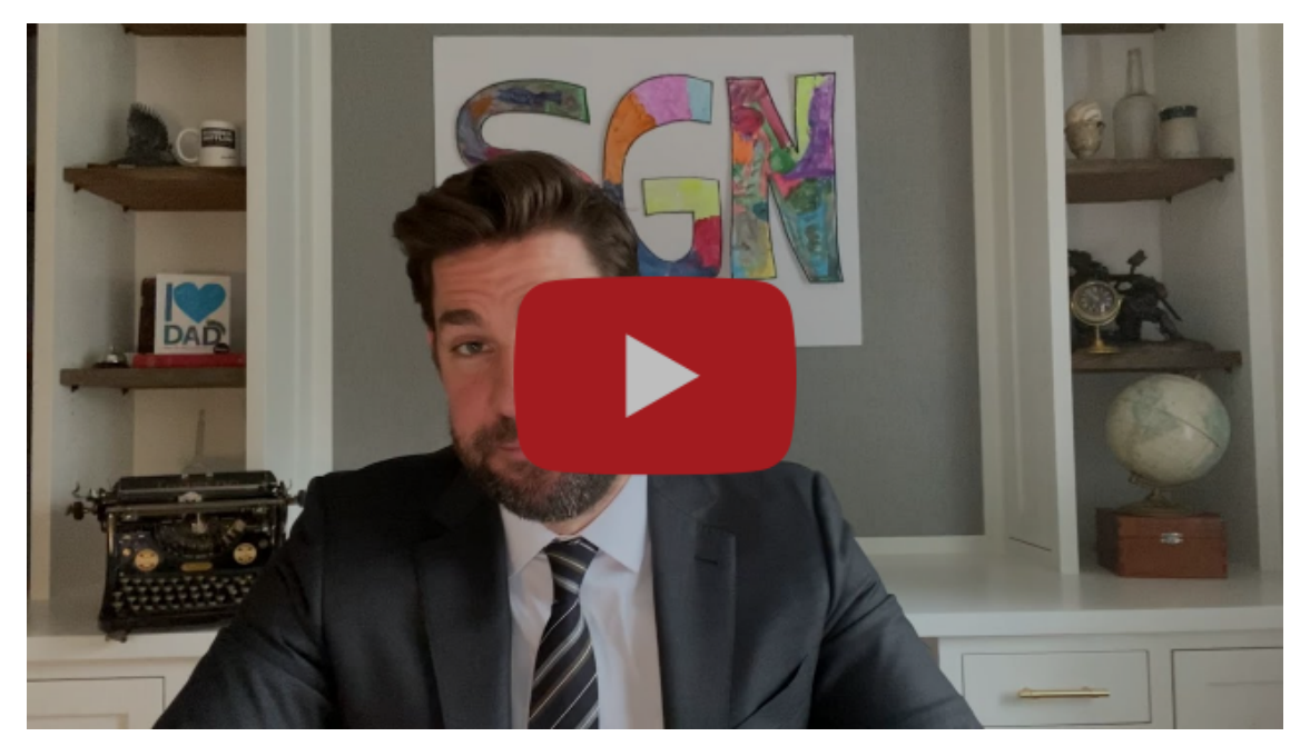
Yet another episode of Some Good News

The youngsters say they created the free hotline as a means of comforting quarantined seniors across North America. However, people of all ages are encouraged to dial 1-877-JOY-4ALL in order to enjoy the regularly updated selection of jokes, stories, guided meditations, and educational messages.