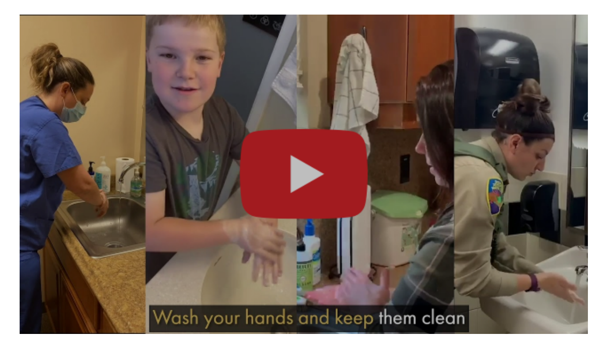
A fun, uplifting video of Marin residents, staff and healthcare workers at work and home.