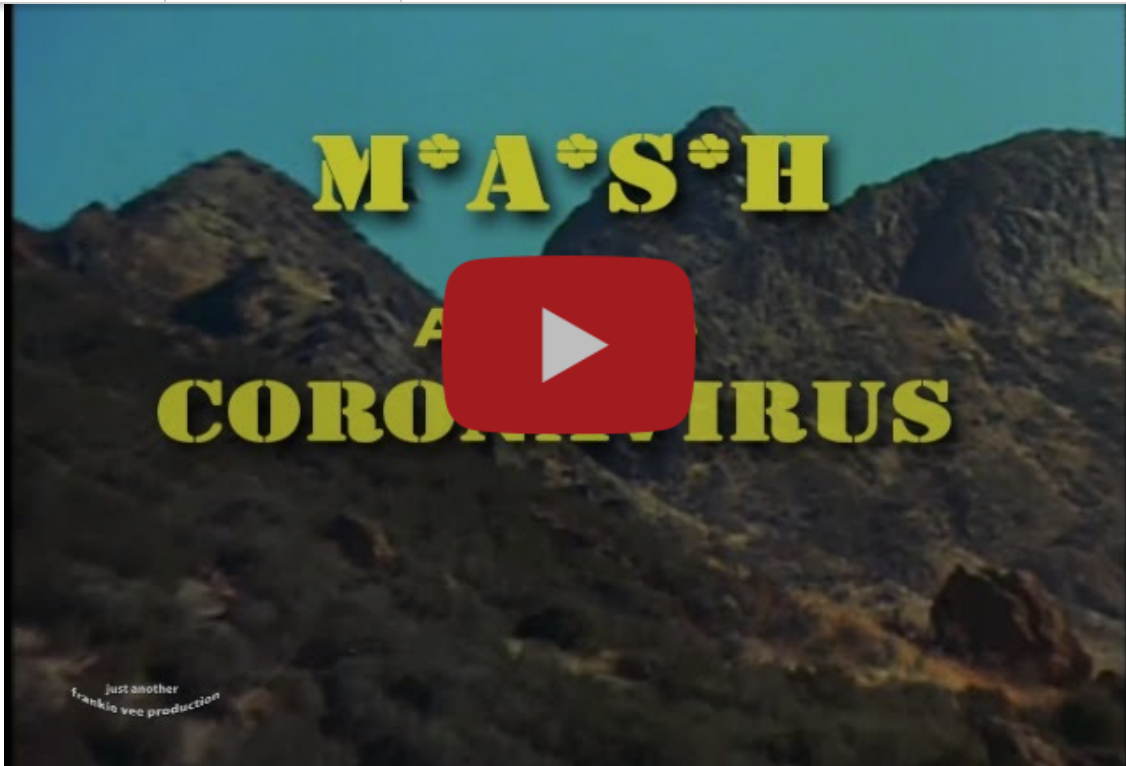
MASH and the Corona Virus