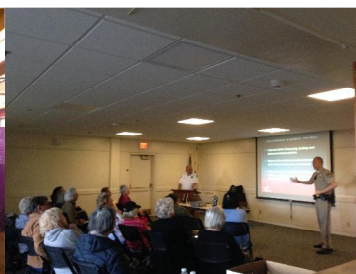
CHP Driving Course