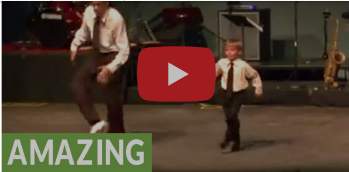
Toddler and Pro Dance Off!