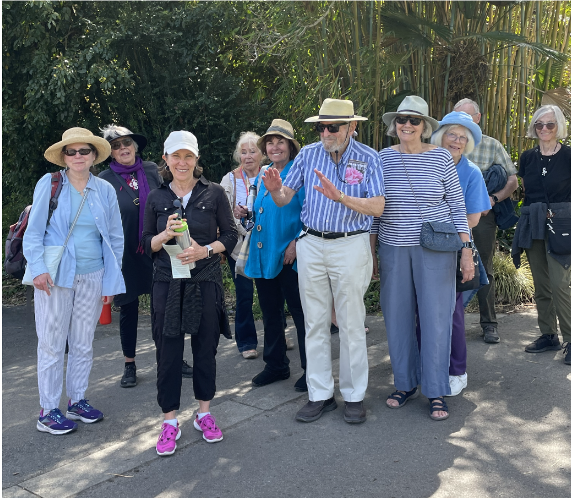
SV Trip to SF Botanical Gardens