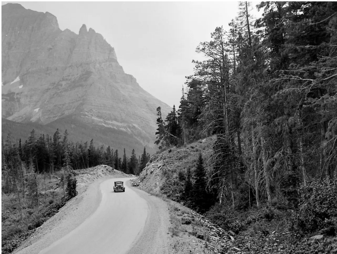
A car drives on a road in Yellowstone National Park in 1927.

Click here to JOIN & REGISTER for this event.