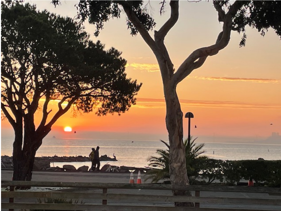
Sunrise along the waterfront of Gabrielson Park