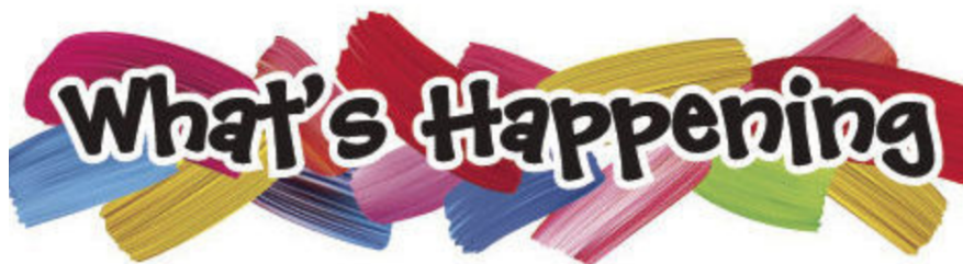
Phoenix Lake

Sunday: COCKTAIL HOUR - POTLUCK SOCIAL , 3-5