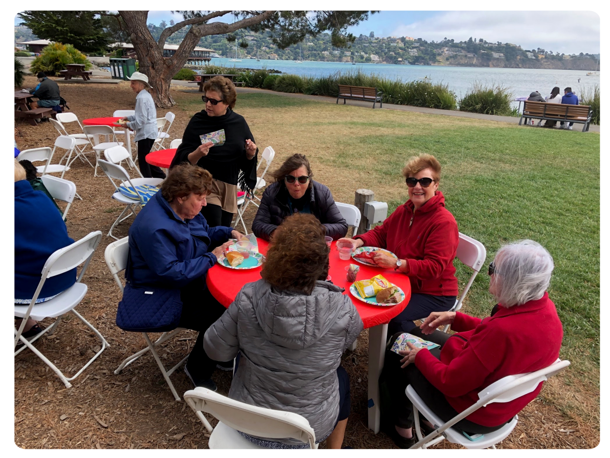
Picnic in Gabrielson Park thanks to the Chamber and Venice Gourmet Deli