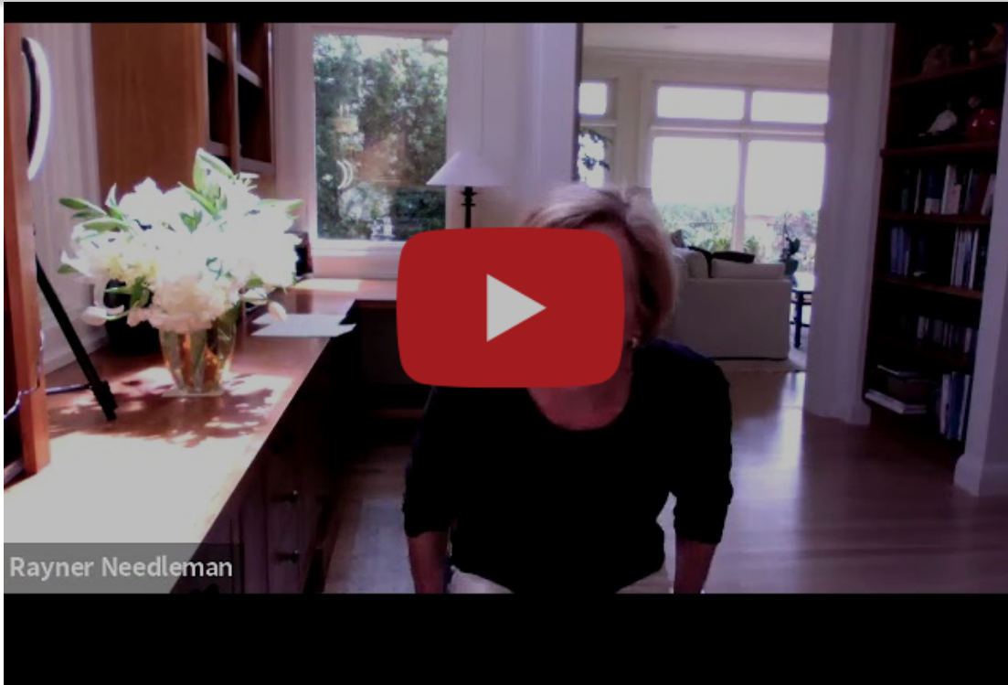
Stretch & Strengthen with Rayner