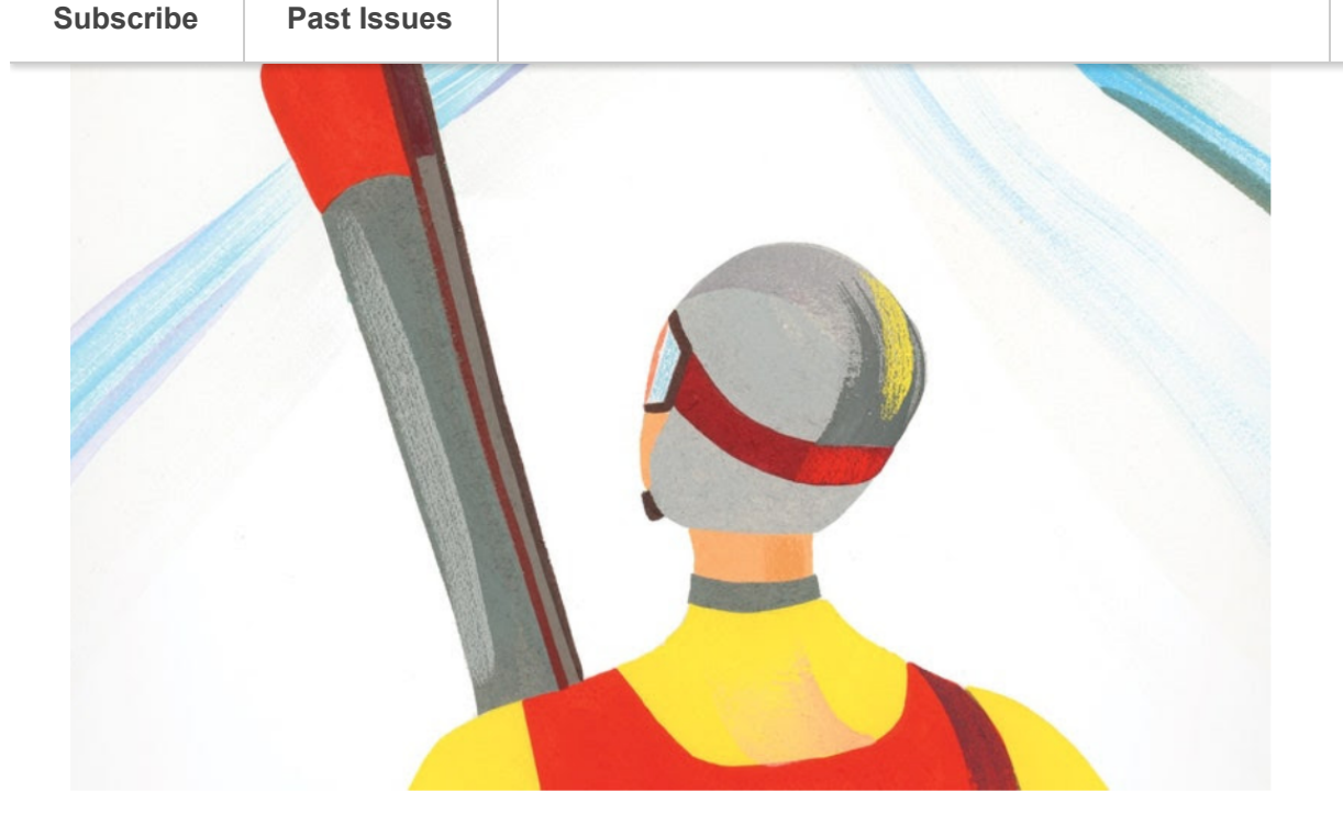
Learning to Ski in a Country of Beginners

As China prepares to host the Winter Olympics, its people get on skis.