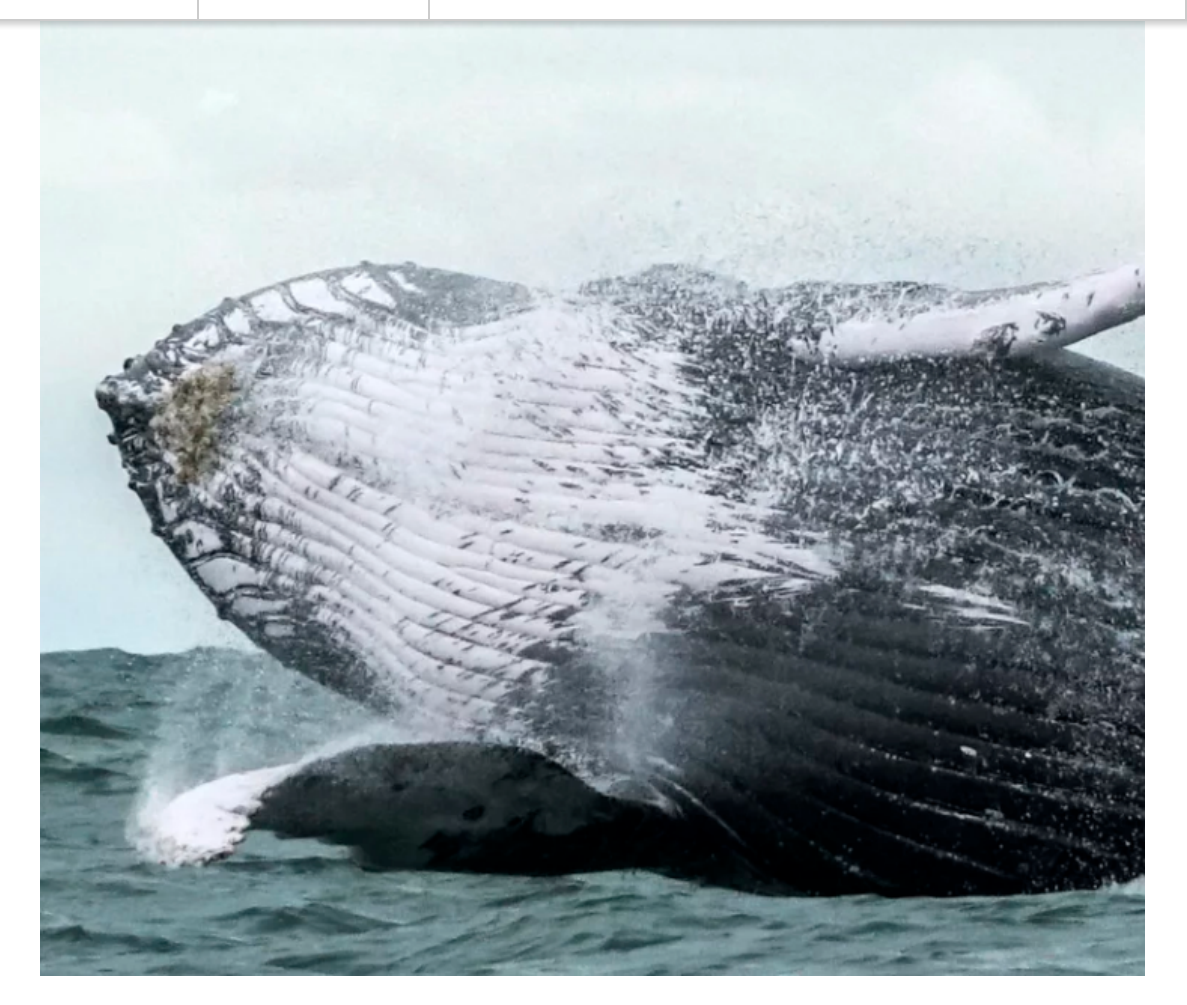
A Lobster Diver In Cape Cod Says A Humpback Whale Scooped Him Up And Spat Him Out

A commercial lobster diver says he escaped relatively unscathed after nearly being swallowed by a humpback whale, in a biblical-sounding encounter that whale experts describe as rare but plausible.