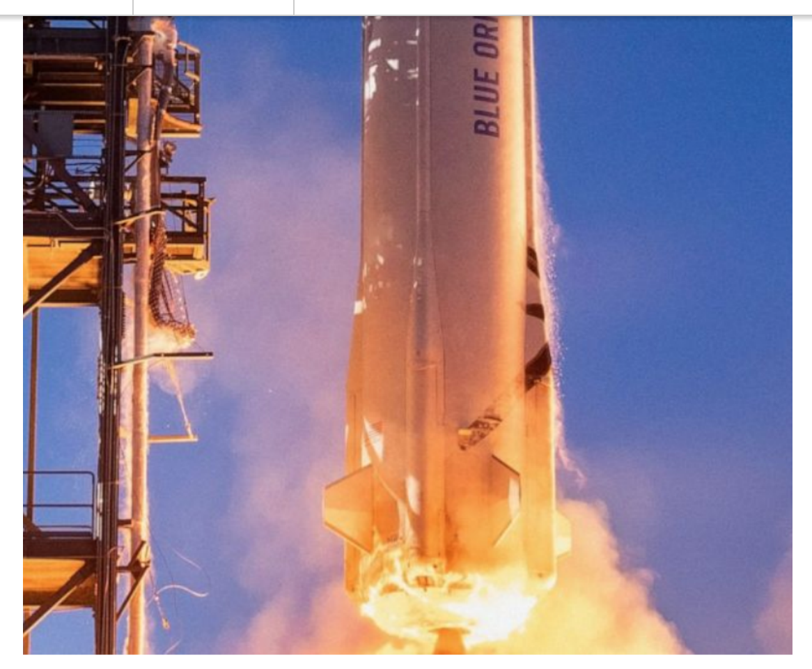
$28M is winning bid for seat aboard Blue Origin's 1st human space flight

The New Shepard will take its first human flight on July 20.