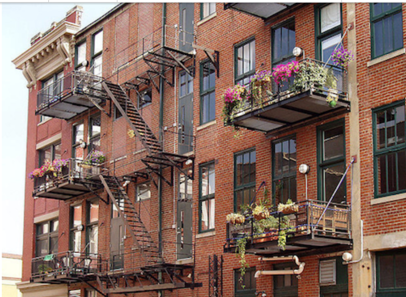
INVENTIONS CREATED BY WOMEN - The Fire Escape