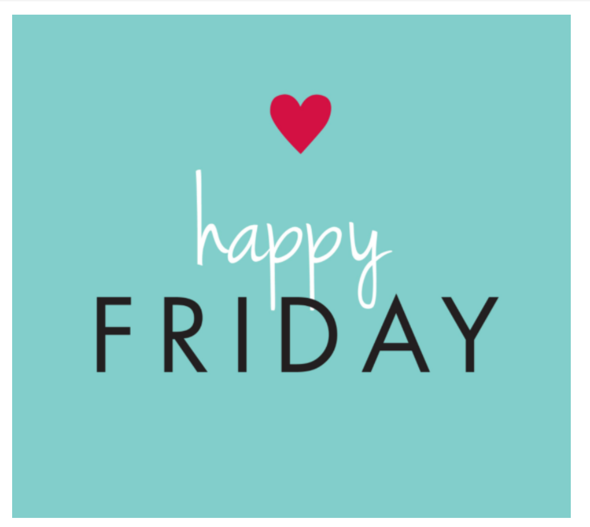
Happy Friday, Villagers

Please <u>send along</u> your suggestions for materials to add to the daily tips. We're always looking for good content. And visit our <u>website</u> for more information about our organization and programs.