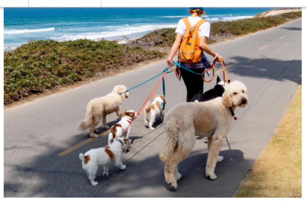
California's 1,230-mile coastal trail 70% complete, according to new online map Some gaps will be hard to bridge, but the map will help in the effort.