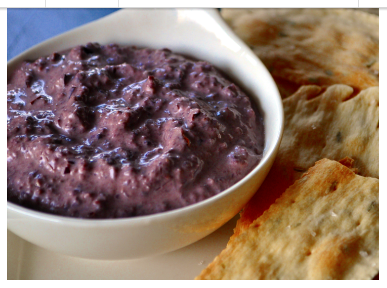
A simple recipe

Kalamata dip 8oz soft cream cheese or nonfat Greek yogurt 3oz kalamata olives, pitted, drained, chopped 1/2 clove garlic chopped Put all in bender, until creamy