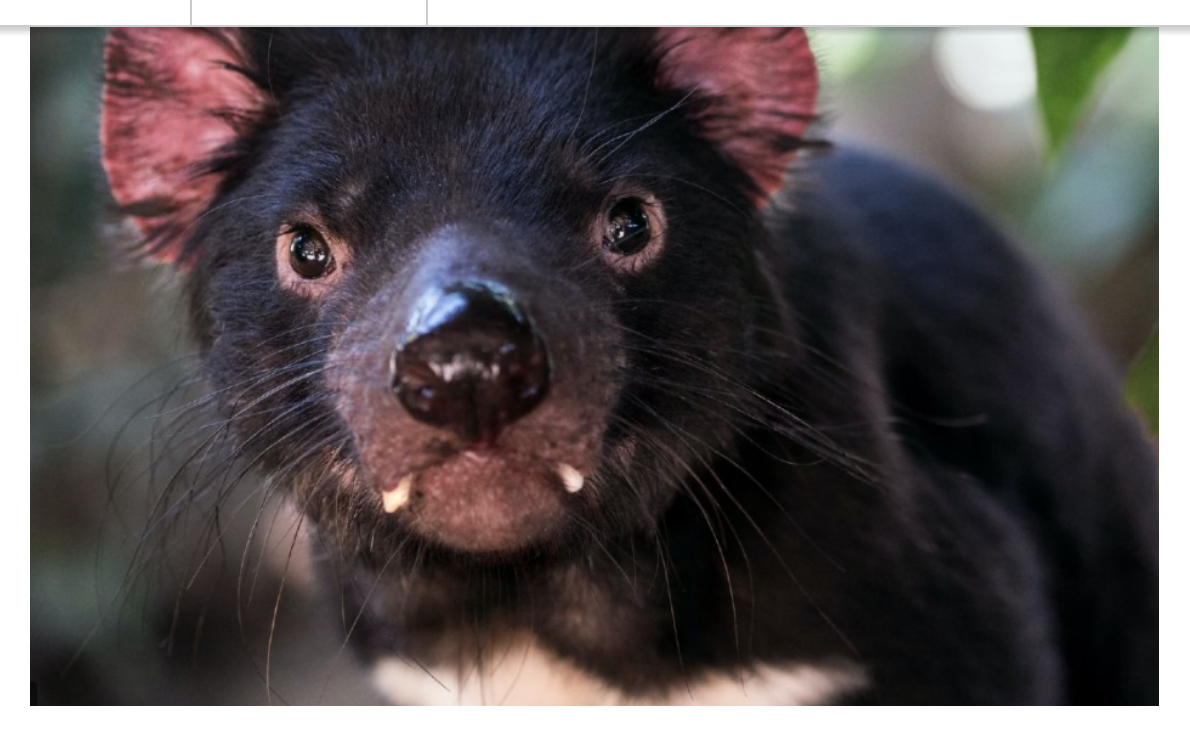
<u>Tasmanian devils born on Australian mainland</u> <u>for first time in 3,000 years</u>

<u>Tasmanian devils</u> have been born in the wild in mainland Australia, more than 3,000 years after they died out in the country.