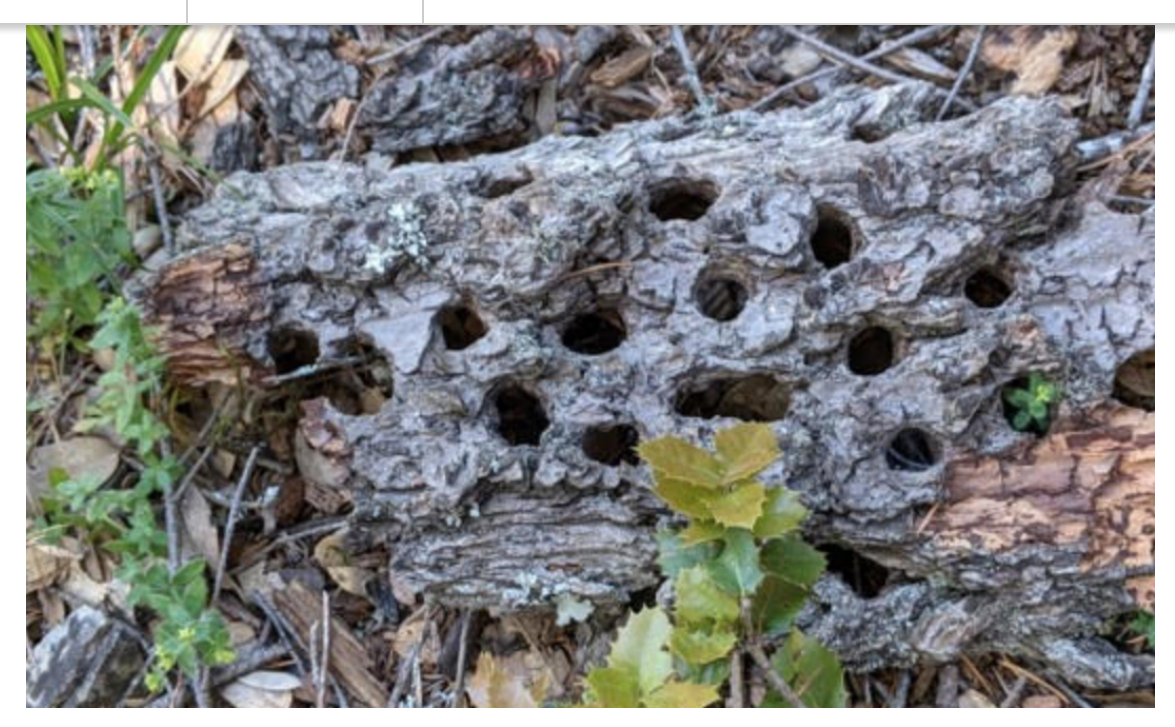
Handiwork of the Acorn Woodpecker