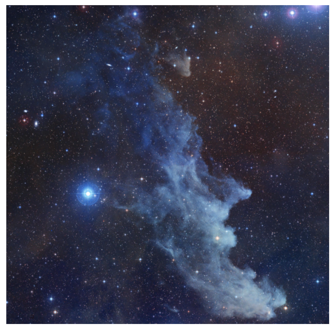
NASA traces source of mysterious fast radio bursts sending signals to Earth