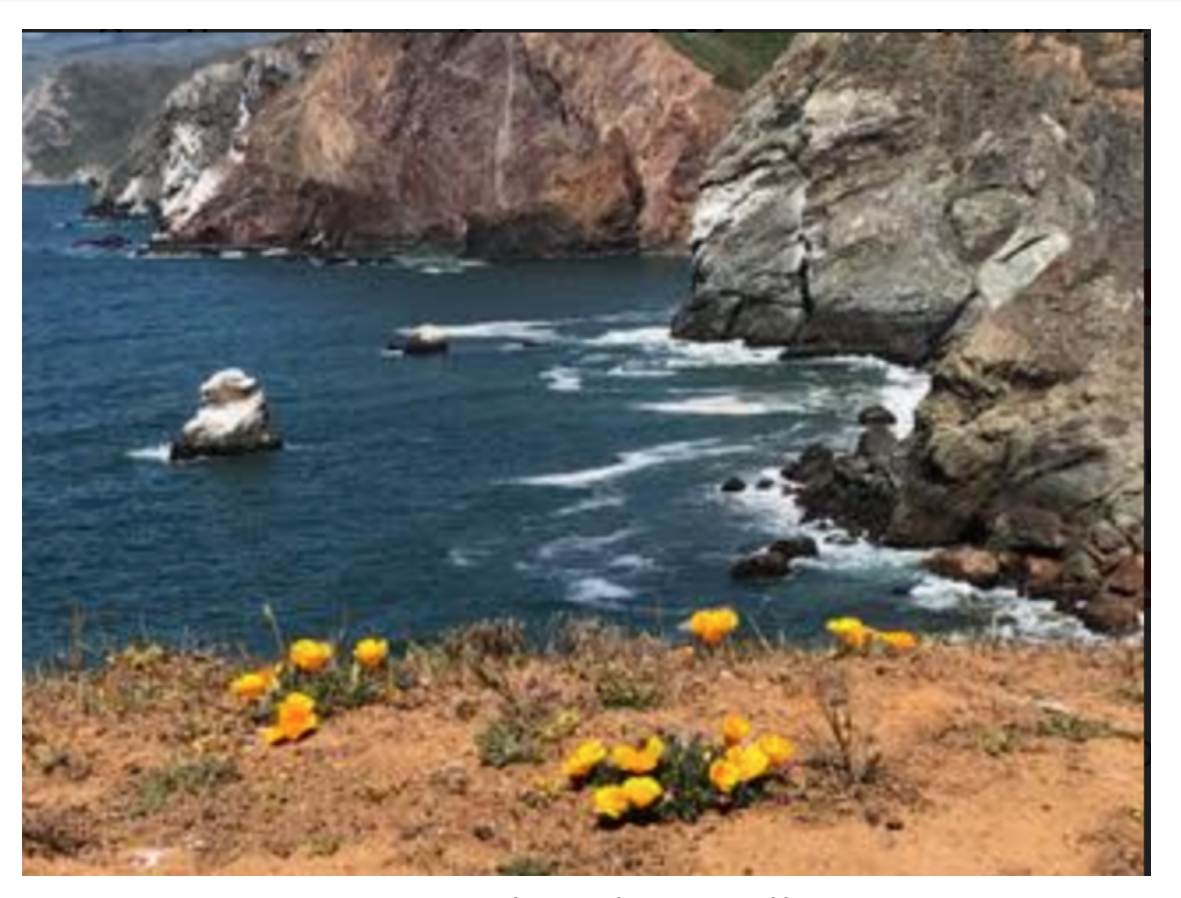
Happy Wednesday, Villagers

Please <u>send along</u> your suggestions for materials to add to the daily tips. We're always looking for good content. And visit our <u>website</u> for more information about our organization and programs.