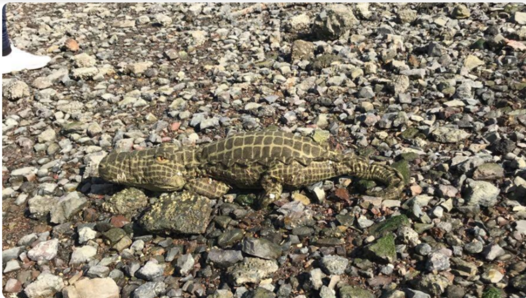
Alligator spotted at Dunphy park. On a walk we stumbled across this little guy, be careful!