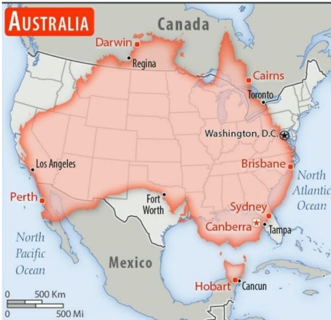
Size comparison between Australia and the United States