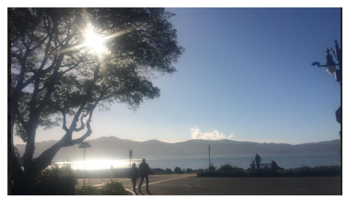
Happy Tuesday, Villagers

Please <u>send along</u> your suggestions for materials to add to the daily tips. We're always looking for good content. And visit our <u>website</u> for more information about our organization and programs.