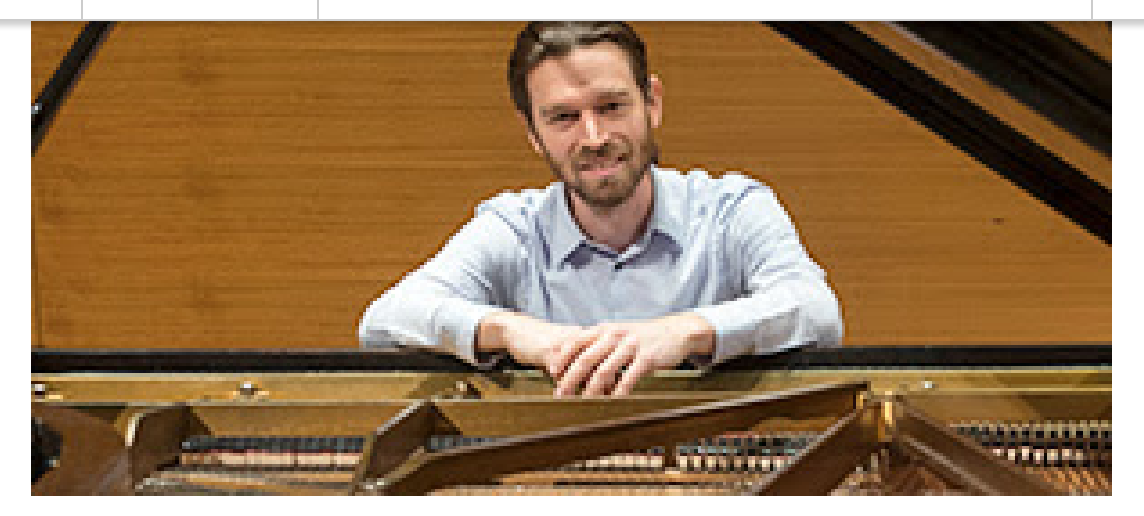
Music & Morsels: Scenes from Childhood