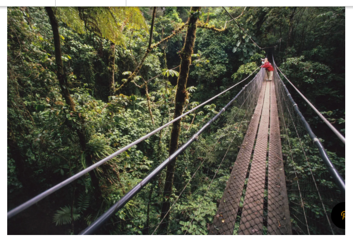
The Best Birthday Trips for Every Age

No matter what age you're celebrating, there's always a reason to pack your bags.