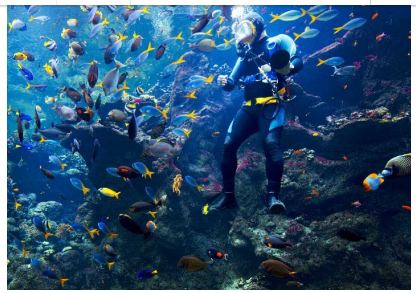
March Academy of Science Updates