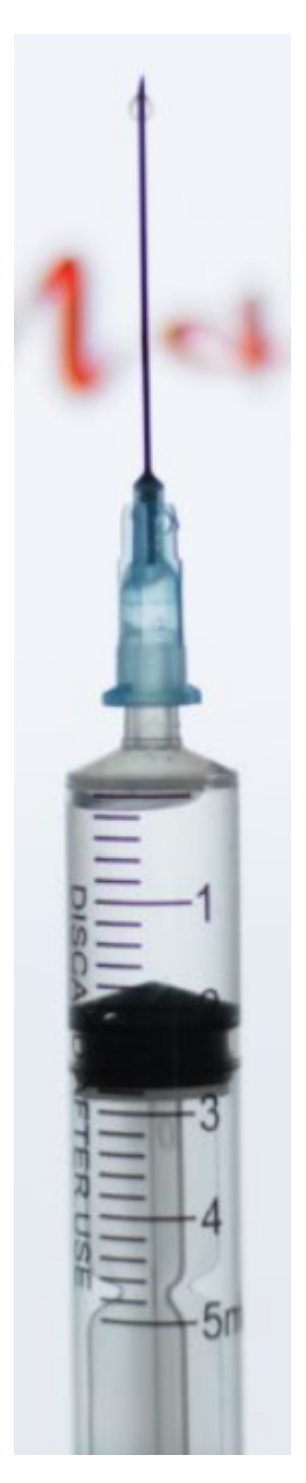
FDA says Johnson & Johnson's single-dose shot

But while the virus has struck far and wide, a lucky few remote locations remain coronavirus-free a year after the virus halted much of the world. Italy, which is in a state of emergency until April 30, was <u>ravaged by the virus</u> <u>last year</u> and currently has one of the highest death tolls in Europe. The destination is now divided into zones, depending on infection levels.