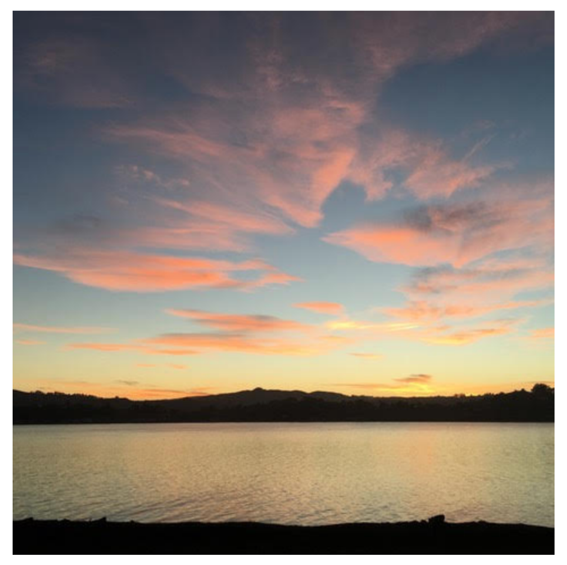
Happy Friday, Villagers

Please <u>send along</u> your suggestions for materials to add to the daily tips. We're always looking for good content. And visit our <u>website</u> for more information about our organization and programs.