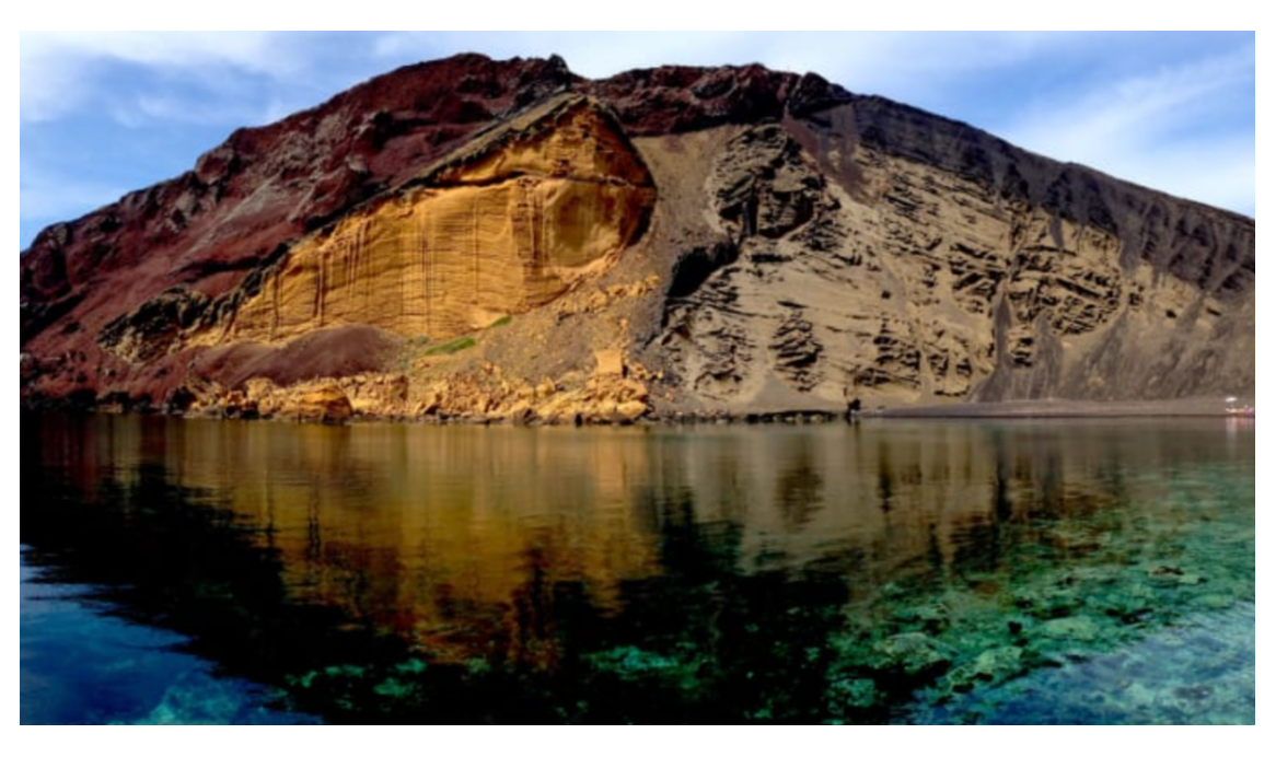
What it's like to live on Italy's Covid-free islands

The <u>SausalitoVillage Website</u> has up-to-date information on COVID vaccinations and tests.