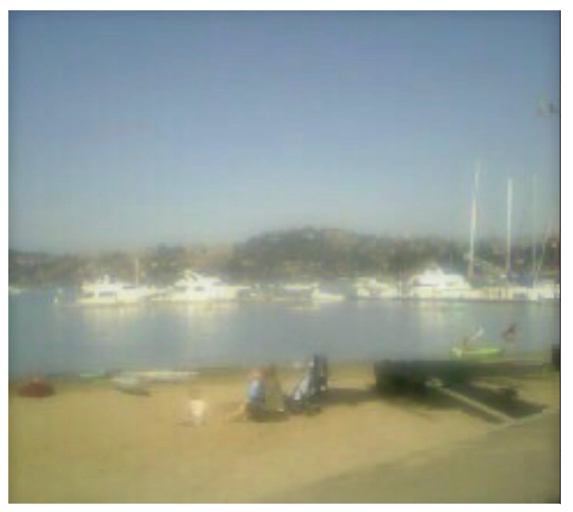
Happy Saturday, Villagers

Please <u>send along</u> your suggestions for materials to add to the daily tips. We're always looking for good content. And visit our <u>website</u> for more information about our organization and programs.