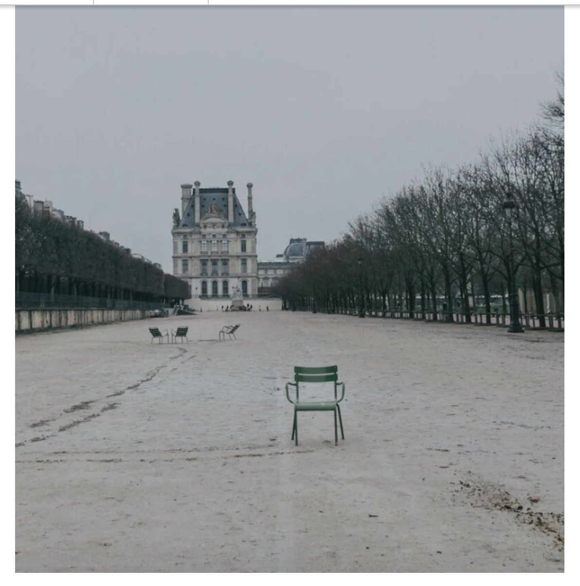
Paris, Shuttered, Must Be Imagined

The pandemic has enshrouded and dimmed the City of Light. But there are many reasons to soldier through the fog.