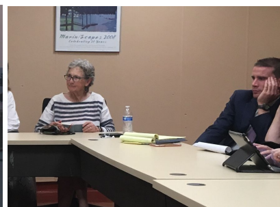
Meeting with Sen. McGuire