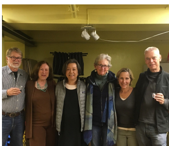
Age Friendly Sausalito