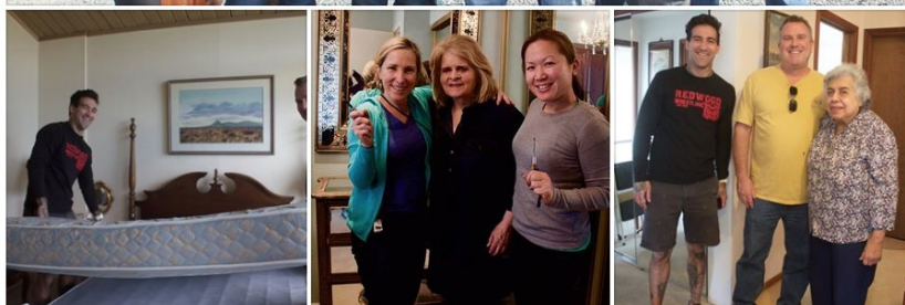
Rotary/SV Chore Day volunteers assisted 25 seniors with some 'heavy lifting'!