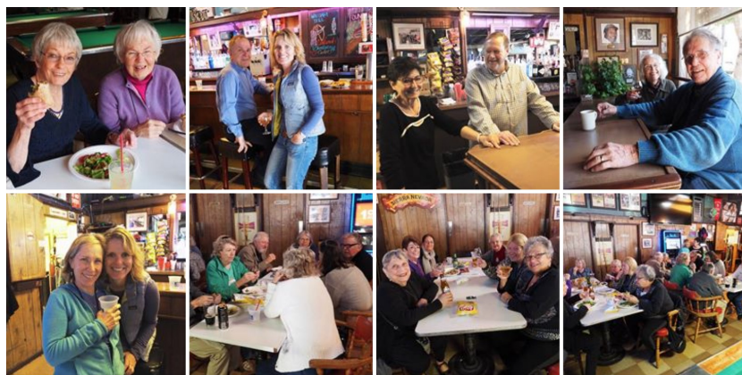
37 attendees enjoyed the second annual Lunch About Town at Smitty's Bar with Driver's food

Check out more happenings at the Sausalito Village Facebook page by clicking on the photo below: