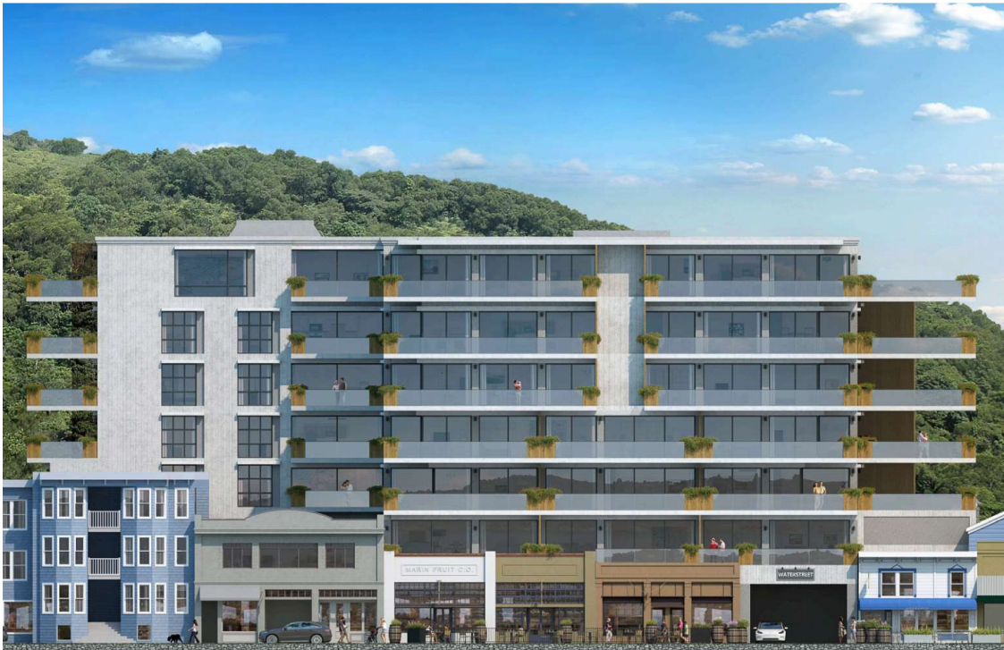
Waterstreet Apartments at 605-613 Bridgeway facade elevation, illustration by Francis Gough Architects