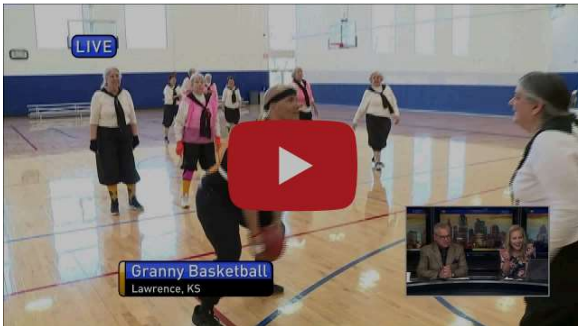
Granny Basketball League championships

Tickets are $25 for adults and $10 for children and will be on sale at the door.